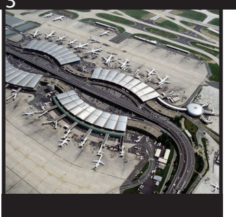
Procedures and teamwork are key